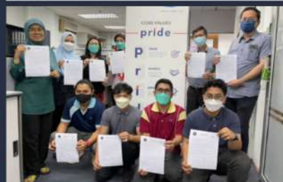
Aqua-Flo Sdn Bhd