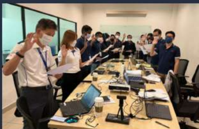
Toyoplas Manufacturing (Malaysia) Sdn Bhd