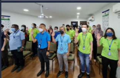
Century Bond Bhd