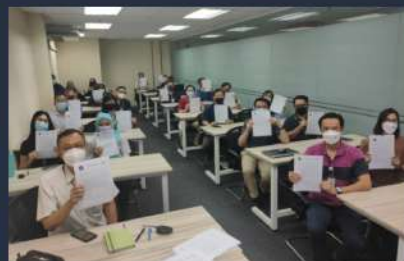
CPI (Penang) Sdn Bhd